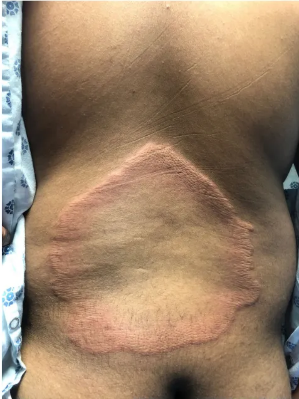
FIGURE 1 Large annular pink indurated plaque with a peau d'orange appearance on lower back

Florida - 10 year old girl developed Acute disseminated encephalomyelitis with autoimmune brain lesions after 2nd Pfizer COVID-19 mRNA jab, July 2022 ( click here )