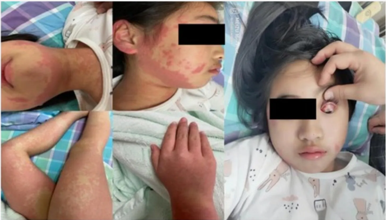
Saudi Arabia - 12 year old boy developed multisystem inflammatory syndrome (MIS-C) following 2 doses of Moderna mRNA vaccine, March 2022 ( click here )