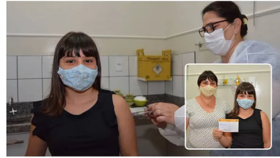
A 10-year-old girl from São Paulo, Brazil has suffered a cardiac arrest and was in critical condition 12 hours after taking a dose of the Pfizer vaccine, the Covid World reported.